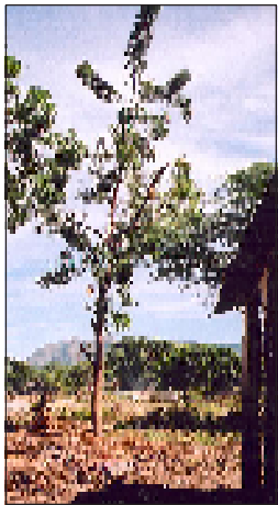
Tree that "saved" family of five.

and his wife and three children had climbed as they watched the swift waters below. As I saw with my own eyes and heard with my own ears their great loss,