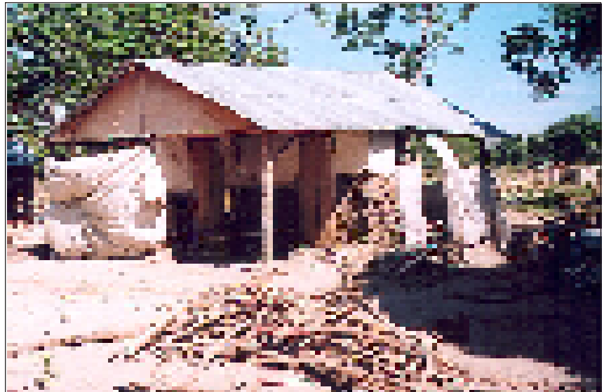
Hanging on to the rafters meant survival.

In Sous Raille, (a rural area just outside of Gonaives), Building Together Ministries helps support a small church. Twelve people of the rural congregation lost their lives. Over 100 homes were swept away by the torrential rain causing flooding of three tributaries flowing from surrounding bare mountains. In Au Poteaux, another rural community, a small business loan