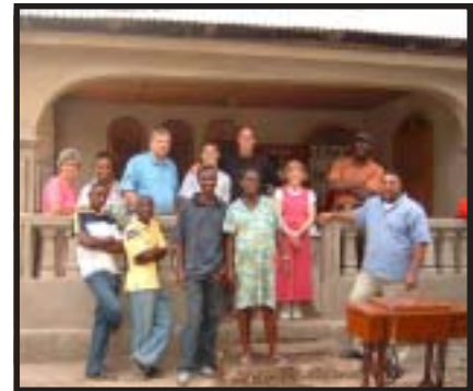
April '05 mission team with Haiti friends.