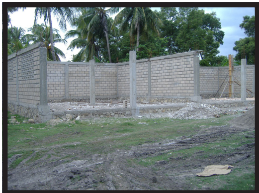
New vocational school under construction