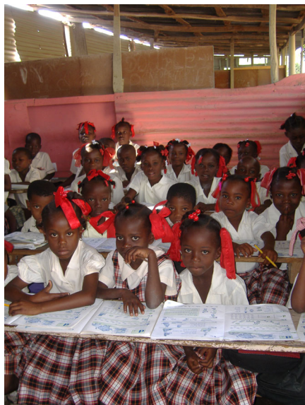
Students at Tarasse community school

our desert school in Pacot. What a blessing!