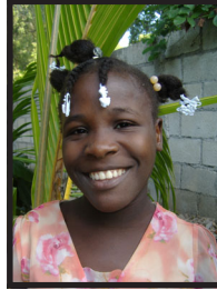
Future Vocational School Students