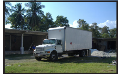
One of the box trucks we need to sell