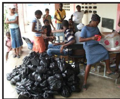
Bags of toiletries await delivery to patients at the hospitals

Our schools have received many new students and we have been able to assist them with school supplies, uniforms, etc.