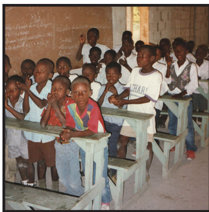
1997 - Original 30 boys

This home presently has over 30 young girls, all of whom are in school. Upon graduation from the home, several of the older girls received a sewing machine are now able to provide for themselves while continuing their high school education.