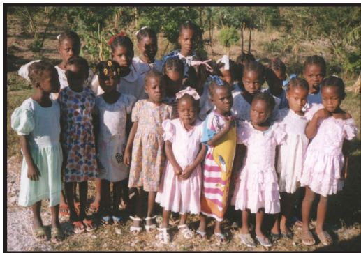
1999 - Original 20 girls

A girl's home was constructed in 1998 and twenty young girls from similar situations were received into the home in February of 1999. These young girls are also receiving wonderful care and quite a few have graduated from a three-year home economics program.