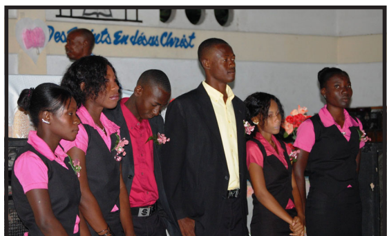
Bittersweet moments as children's home graduates prepare to enter a new phase of their lives.